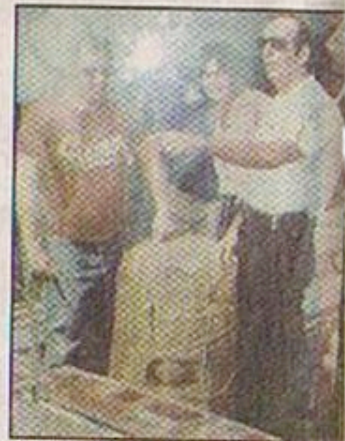
A photo of a police drug bust involving a bale of marijuana — sometimes known as a "square grouper" when dumped at sea — is displayed at the Castaways Marina bar.

This Grolsch nomination comes on the heels of the Town of Jupiter's proposed Riverwalk project.